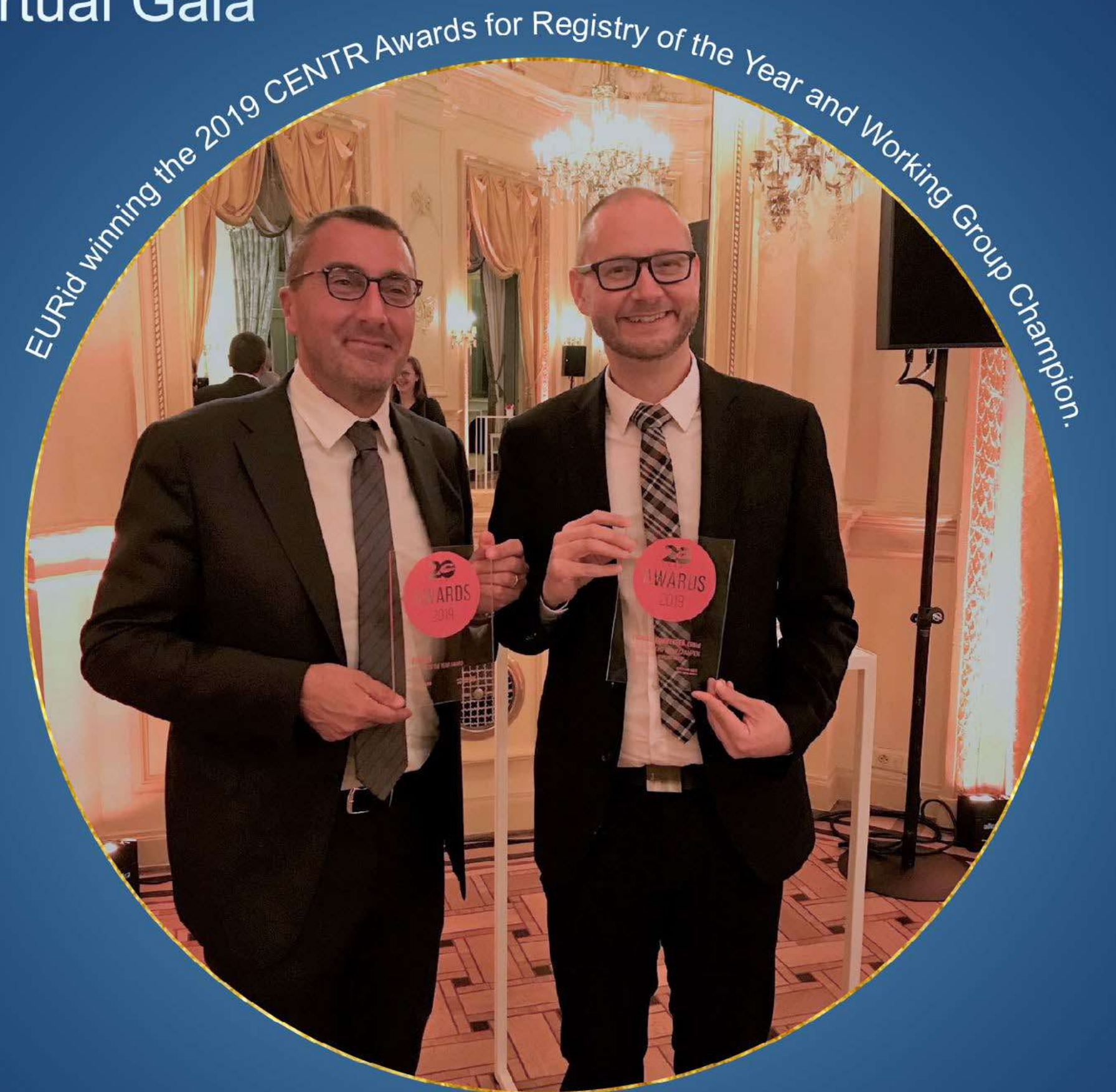
EURid winning the 2019 CENTR Awards for Registry of the Year and Working Group Champion.

In hoping you're as excited as we are to celebrate your online success, let's start the show!